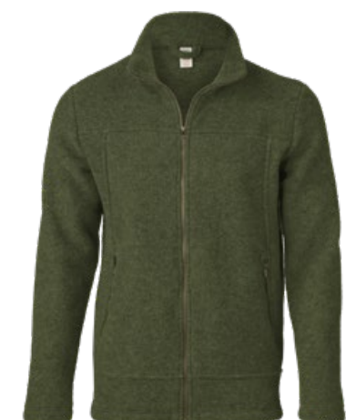
58 4430 044E – reed mélangé