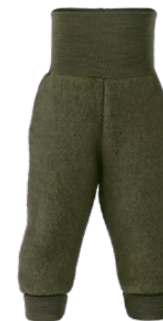
57 3501 044E – reed mélange

● 100% virgin wool (organic), fleece sz. 50/56, 62/68, 74/80, 86/92