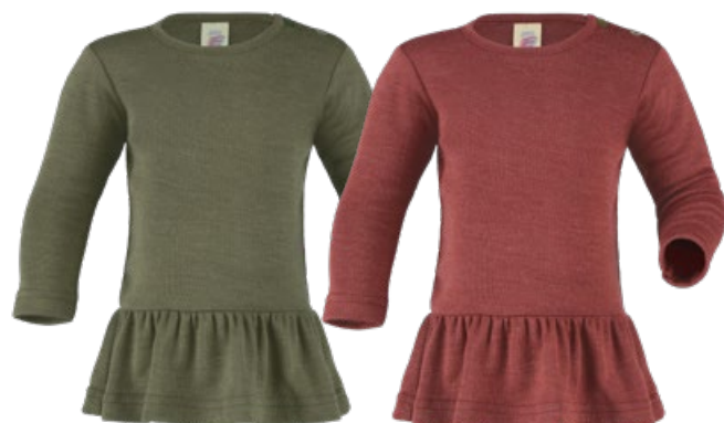
70 5515 43E – olive