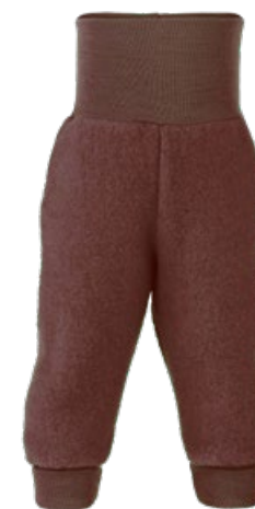
57 3501 079E – cinnamon mélange