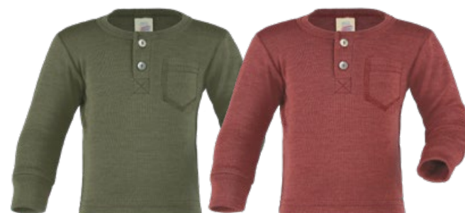
70 5533 43E – olive