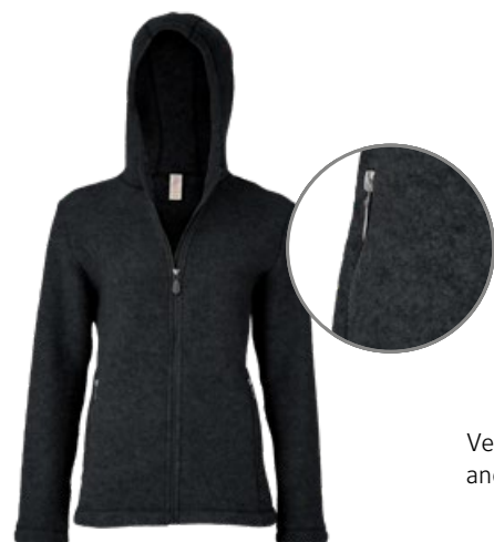
58 4421 090 – black mélangé

Very handy – Chin protection and zippers for the pockets.