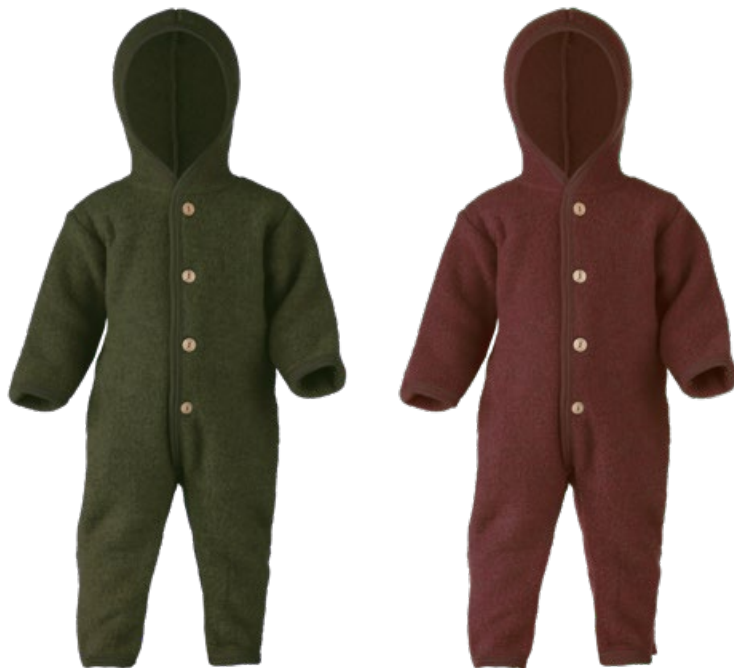
57 5722 044E – reed mélange