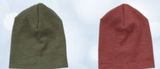
70 5541 43E – olive