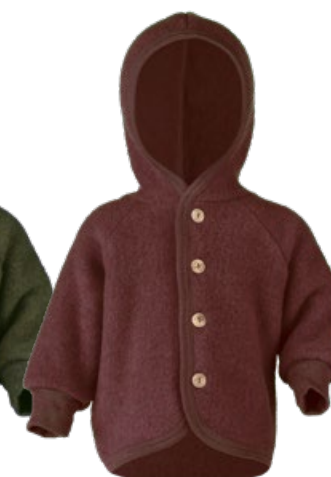
57 5520 079E – cinnamon mélange