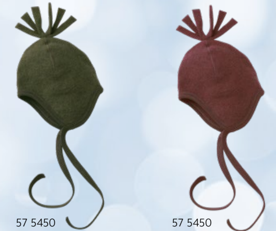
57 5450 044E – reed mélange