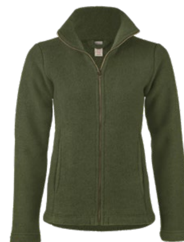
58 4470 044E – reed mélangé

Men's jacket, waisted, with zipper and pockets with zip