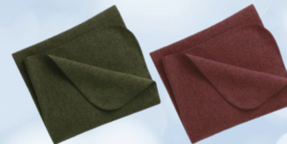
57 8501 044E – reed mélange