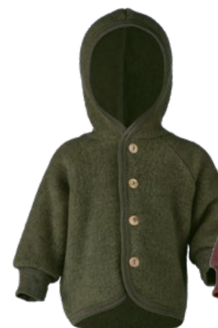
57 5520 044E – reed mélange

● 100% virgin wool (organic), fleece sz. 50/56, 62/68, 74/80, 86/92