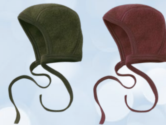
57 5550 044E – reed mélange