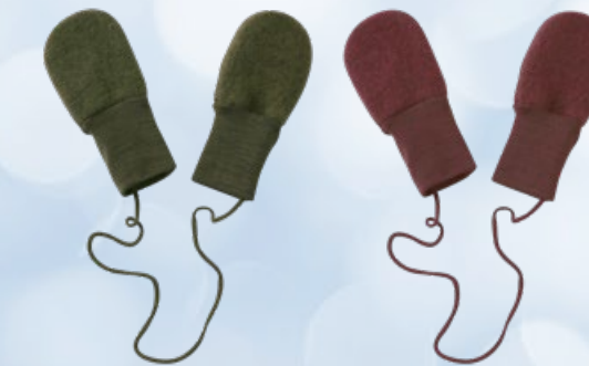
57 5570 044E – reed mélange