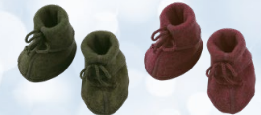
57 5582 044E – reed mélange